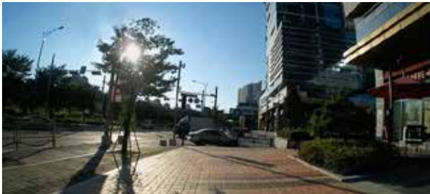
Excellent depth-of-field - objects near and far are crisp and clear