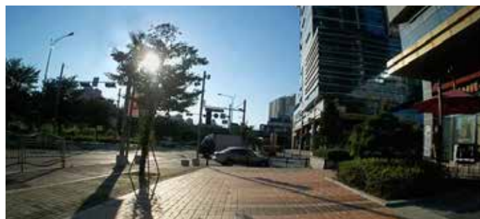
Excellent depth-of-field - objects near and far are crisp and clear