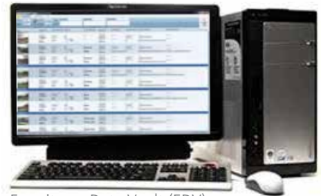
Eyewitness Data Vault (EDV) or Eyewitness Data Vault Lite

Multi-Dock: Insert up to 6 cameras for charging and downloading. Connect additional multi-docks together for larger fleets.