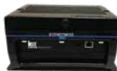
Eyewitness HD DVR

Optional wireless transfer allows camera to stay on officer.