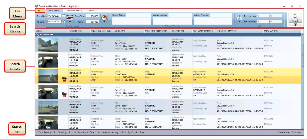
EDV Search Results

The Search screen displays all of the records that meet the specified search criteria. Double-click on a record to view more information. If the record is a KSI video file then it will open in EDV's player. If the record is a different file type then additional information is displayed and the content can be viewed using the associated Windows application.